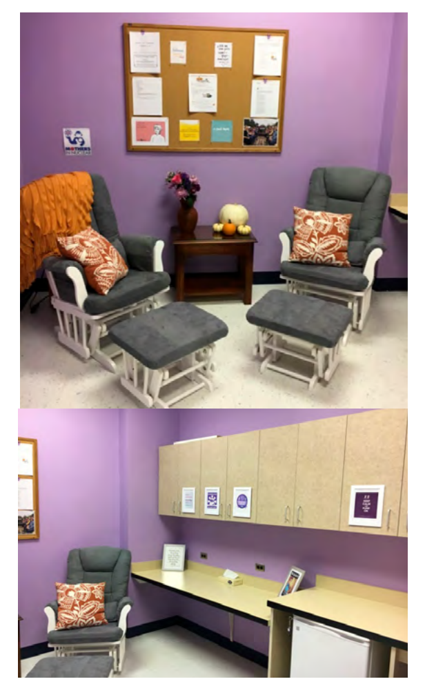
A recently upgraded mothers room at TMI.

PIN has been successful, and with the support of the TMI chapter of U.S. Women in Nuclear, has offered a session of required SOER 10-2 training at a later start time to accommodate working parents who have to handle daycare drop-off or school drop-off before coming into training. The session was widely attended with positive feedback. Additionally, upgrades to our Mother's Rooms are in progress and much appreciated by the moms using them.