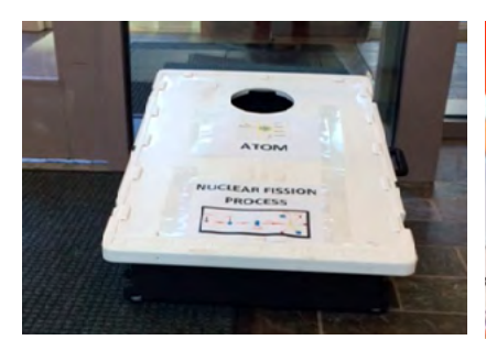
Nuclear Fission Corn Hole Activity