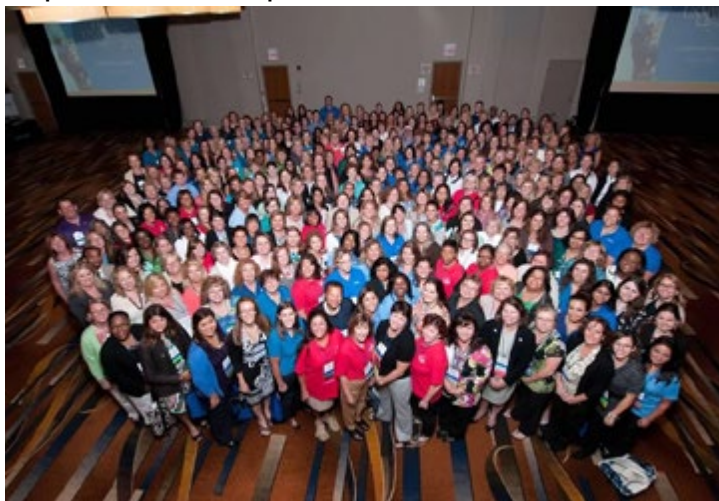
2013 National Conference Attendees

The 2013 U.S. Women in Nuclear National Conference took place July 21 – 24 in Chicago, IL at the Chicago Swissôtel. This year's conference theme was "Creating Value Through Change." Over 460 attendees participated, of which 36 were sponsored college students. U.S. WIN selected students by application and paid for their registration and hotel expenses. This sponsorship was made possible by the generous support of our host, ExelonGeneration, and all of our sponsors. The following students were asked to provide their impressions of the conference.