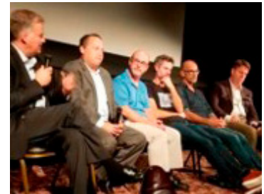
Panel made up of Clean Jobs for Pennsylvania coalition members, Exelon employees and Pennsylvania Nuclear Energy Caucus lawmakers