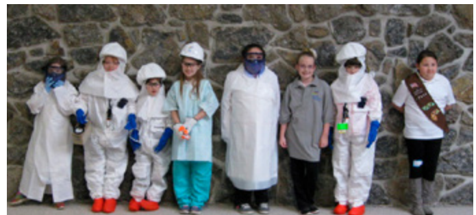
Tiny 'Rad Workers' take part in Nine Mile Point's inaugural 'Get to Know Nuclear' Girl Scout patch day at the site's Nuclear Learning Center