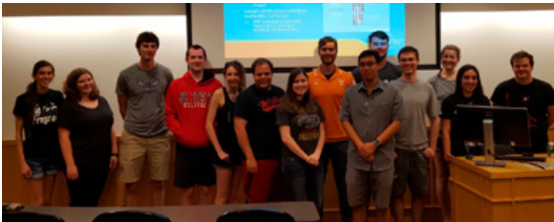
North Carolina State University Students learn about the benefits of small modular reactors, and co-generation opportunities

Girl Scout Patch Day: The inaugural "Get to Know Nuclear Day" was a rousing success at NMP. Twenty-six girl scouts between Kindergarten and 8th grade and parents attended the patch session, and were very impressed by the event. Nineteen site chapter members and eight other site employees, including folks from the senior leadership team and other managers, volunteered to make the event run smoothly. The afternoon of outreach started out with a safety brief, and how the nuclear industry considers safety prior to any activity. After a presentation on the basics of nuclear science, the scouts were split into activity groups. Hands-on events conducted included: M&M half-life counting, What is my Dose?, Marshmallow Isotopes, Career Dress-Out, Advanced Nuclear Topics, and a tour of the Unit 1 Simulator. Through the variety of activities, event participants learned all about how nuclear power works, the robust safety culture in the industry, training and response to industry events, and environmental stewardship. Feedback from parents, scouts, and troop leaders was extremely positive, and preliminary discussions have already been held to host another session in the upcoming months. ✨